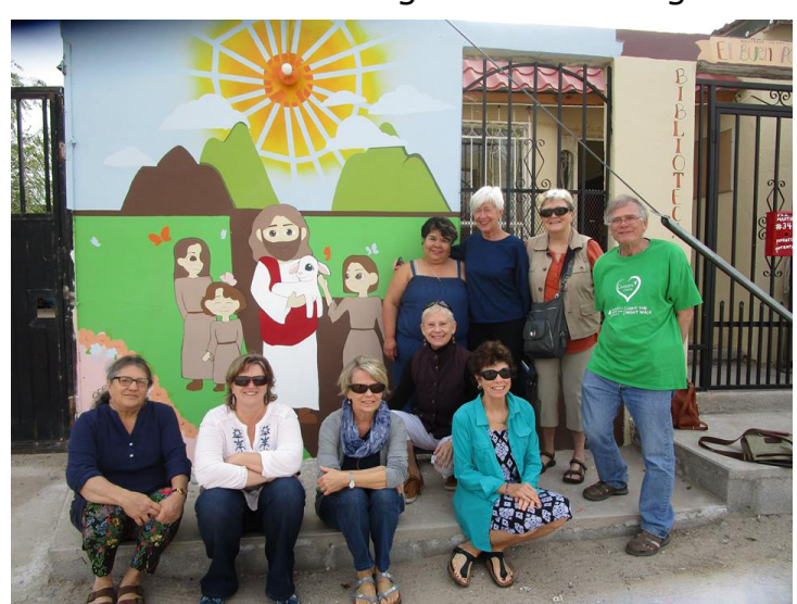
Border delegation visits the the scholarship and tutoring program El Buen Pastor

In El Paso, the participants heard from and dialogued with representatives of the Diocesan Migrant and Refugee Services of El Paso, the U.S. Border Patrol and the Annunciation House shelter for undocumented migrants. They also observed processes of the Federal Immigration Courts, and prepared a meal at the Columban Mission Center for about 60 migrating people staying at Annunciation House, which first opened its doors in 1978. The migrants and refugees easily relate to the program participants in